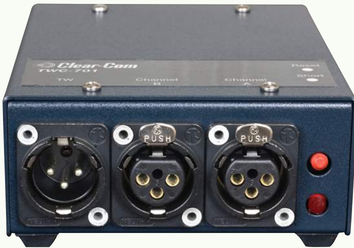
TWC-701 Front panel