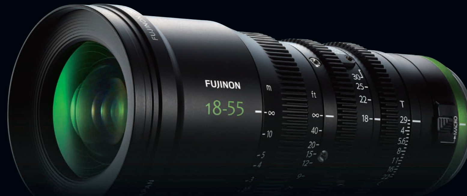
Image expression moves into a new era, thanks to the unique optical technologies of cinema lenses by Fujifilm