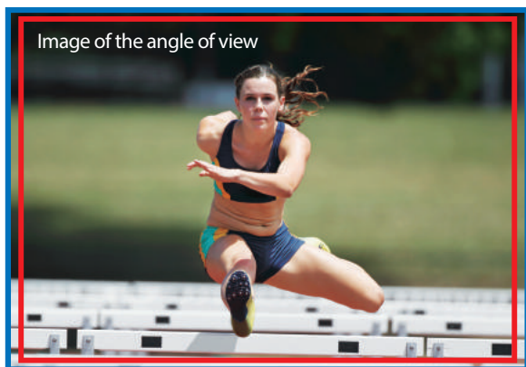
□ XA77x/f'=732mm □ XA76x/f'=710mm