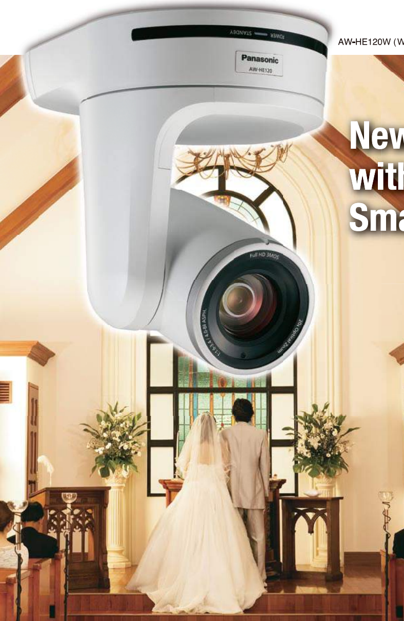
AW-HE120W (White Model)