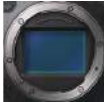
Sensor in AW-UB50

The AW-UB50 boasts a 24.2-megapixel full-size MOS sensor and the AW-UB10 features a 10.3-megapixel 4/3-inch MOS sensor, both realizing high-quality video with excellent color reproduction and resolution. The high-sensitivity, large-format sensors achieve a shallow depth of field for emotional expressiveness with beautifully blurred backgrounds. In addition, detailed expressions can be captured even in low-light environments thanks to wide dynamic range (AW-UB50: 14+ stops / AW-UB10: 13 stops).