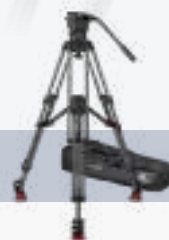
System FSB 10 Mk II ENG CF MS 1043M