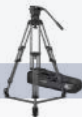
System FSB 10 Mk II ENG CF GS 1042M