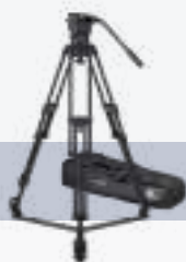
System FSB 10 Mk II ENG AL GS 1041M