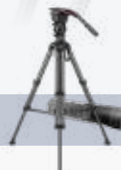
System FSB 14T Mk II HotPod 1446M