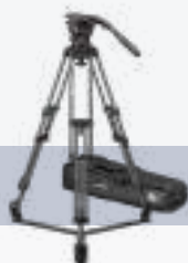
System FSB 14T Mk II ENG CF GS 1442M