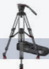
System FSB 14T Mk II ENG CF MS 1443M