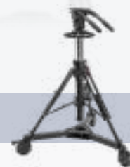
System FSB 14T Mk II Ped C III 1470M